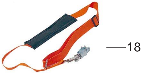
Single Shoulder Strap Model#: 746191

WARNING! Read the owners manual and follow all warnings and safety instructions. Failure to do so can result in serious injury to the operator and/or bystanders. Never attempt to mount a steel blade to a machine that is not specifically designed for that purpose. Never attempt to mount a steel blade without using all components of the blade attachment kit, including shoulder strap and barrier safety bar.